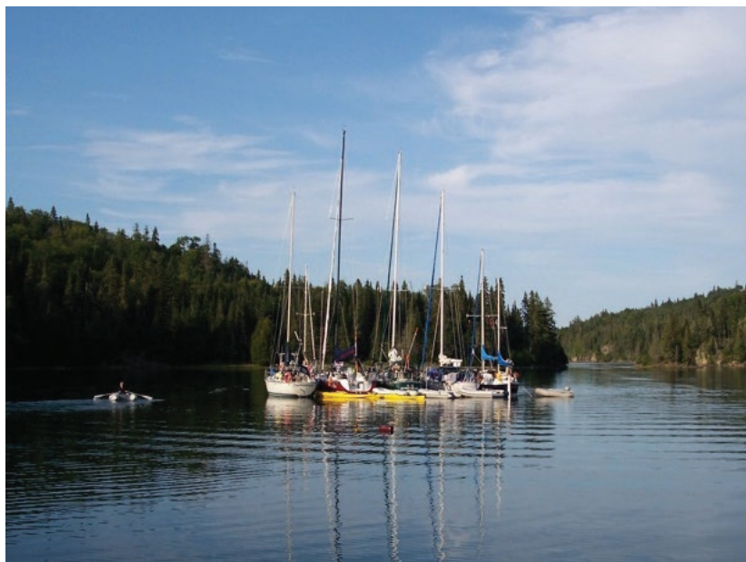
SUNORA 2017 participant boats rafted together.

We moored in many of the most beautiful anchorages along Superior's North shore including Loon and Otter as well as the lesser known locations such as Root Bay. We enjoyed a BBQ dockside in Nipigon, a delicious banquet at the Quebec Lodge in Red Rock, and great companionship sharing a brew while rafted together with friends. The final evening's celebration was held at Porphyry Island. Not to forget the keen competition with the daily races. We'd start at 11am daily and give it our best to the next anchorage.