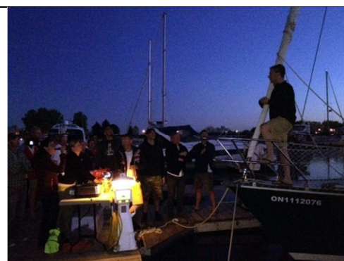
There was a good turn out and fun to be had beyond the twilight hours. Next up, Pier 2 Party scheduled for Wednesday, July 16 th , après race.